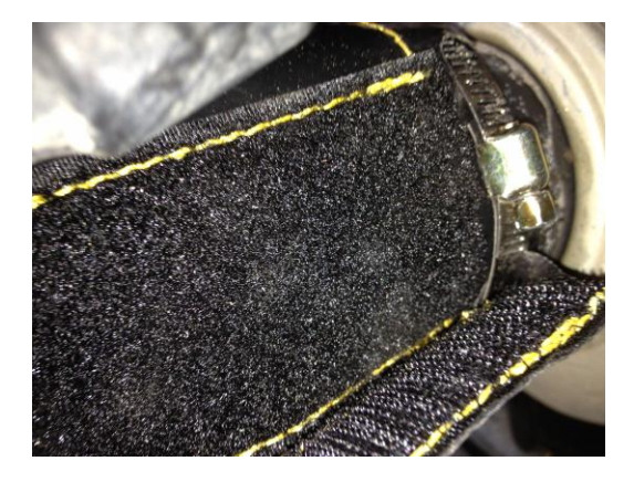
Ensure clamp is even around joint. Place loop Velcro under clamp and tighten.